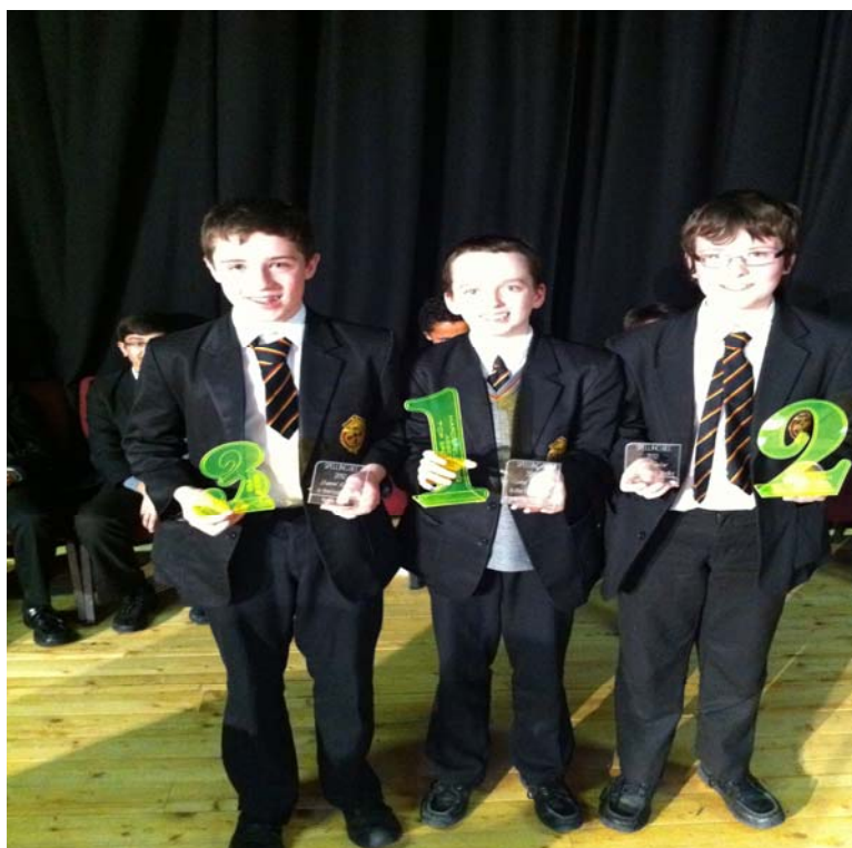
The Abbey's top 3 junior spellers in 2011/12

During the second term the English department run spelling tests within each junior class, the best speller in each class goes on to represent their peers in our in-house competition: The Abbey Spelling Bee. It is an exciting and fierce competition, with the final 15 receiving trophies and the final 3 receiving cash prizes and winners' trophies.