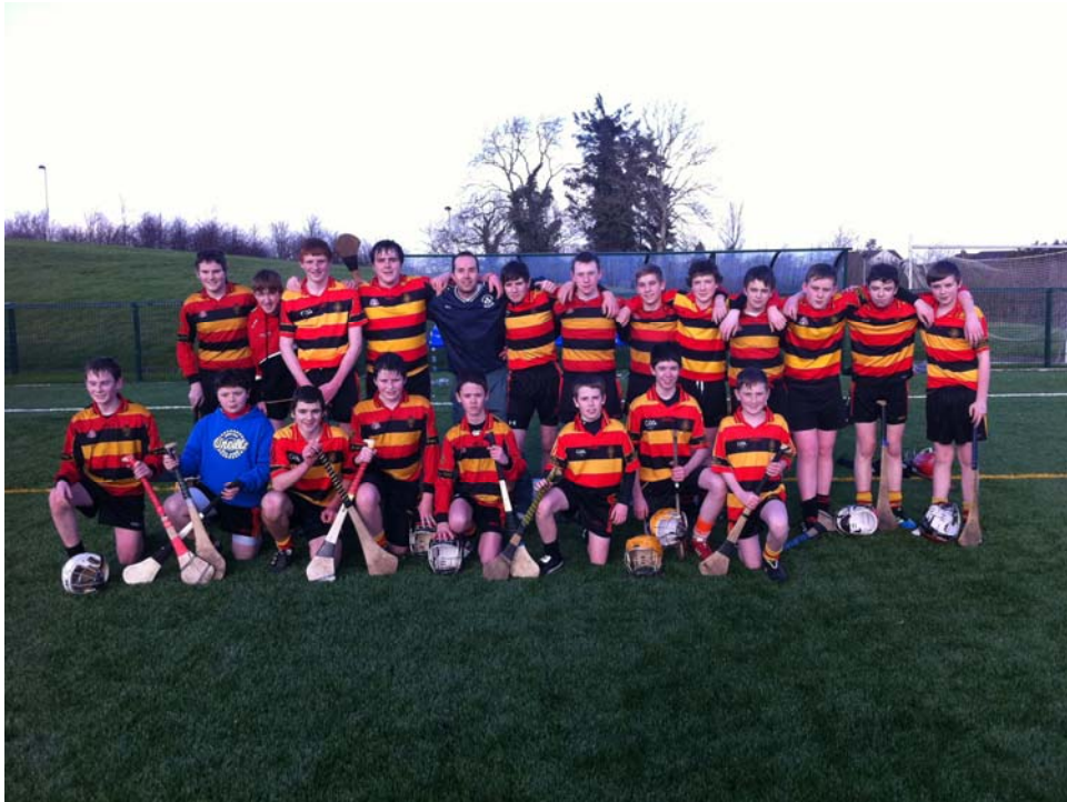
Year 11 team; Noone Cup winners 2011/12

This year there were 3 hurling teams in the Abbey, in years 9, 10 and 11. It was a very successful inaugural year for the sport, as the Year 10s went on to win their league and took home Ulster Colleges medals and the Mallon Cup. The Year 11s won the Noone Cup and an Ulster Colleges medal each. The years 9s got to the final of the Rehill Cup, but were unfortunately beaten by one point by Coláiste Feirste.